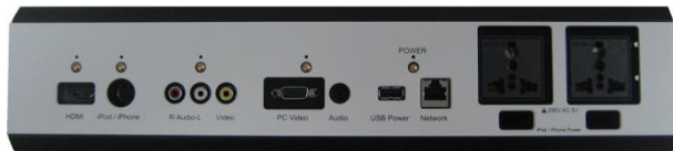
SH-500PRO1 (Custom Panel)

Smart Harmony SH-500ProI and SH-2000PRO1 are our new development after SH-1000ProII version. It is affordable product but still musician to feel quality for all A/V equipment. We come with HDMI over CAT (SH-500PROI only) and HDMI output version for clients choosing. SH-500ProI and SH-2000PROI are designed by simple and direct circuit which includes all useful function such as iPod, USB, LAN port, composite, HDMI and VGA. Power socket, LAN and USB charge is also available for customer request. Optional on auto selection on AV inputs.