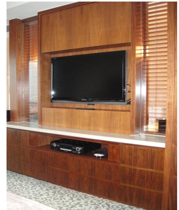
Projects completed in 2010 . Mandarin Oriental, Macau