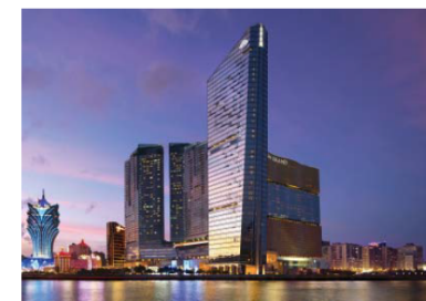
SmartLiving Technologies collaborated with the Mandarin Oriental in Macau.

SmartLiving Technologies continues to develop its product range, and is a platinum member of Hotel Technology Next.