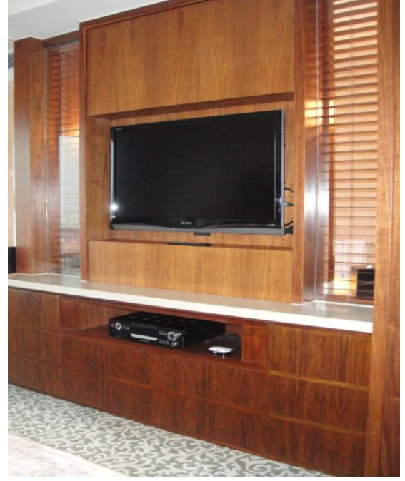
Projects completed in 2010. Mandarin Oriental, Macau